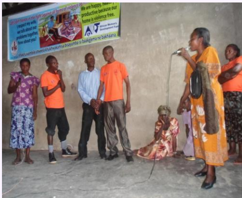
A live theatre performance at Magale Parents S.S

The Consultant presented the first drafts to Better HAG Uganda management, prompting an adhoc meeting to review, address gaps and input in both scripts. This review and input process guided the Consultant into the development of the final scripts for 20-25 minuted-stage play and 180 minutes of radio series. The latter is titled ' The Good Samaritan '.