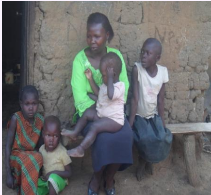
Sarah* and her 3 children at her mother's place where she had sought refugee following threats of death.