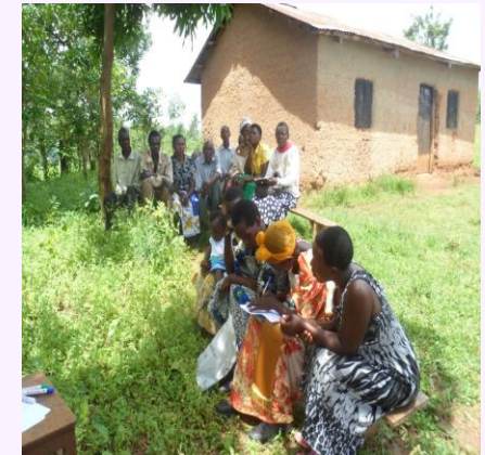
Good Point: Women document legislative procedures of dealing with violence