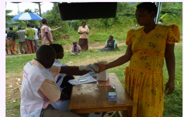
Women embraced the exercise