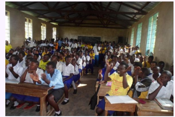
Students give a rousing ovation to the drama group during their live presentation

Effective GBV response calls for sufficient knowledge on the legislative framework of dealing with this public health crisis. Different stakeholders including the Police, partner CBOs, Local council 1 Chairpersons, health workers, religious leaders as well as individual men, women and girls need this crucial information if they are to ably and effectively coordinate the response.