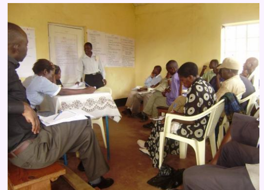
Participants during the project orientation and planning meeting

This was a 1 day meeting for 20 participants including 7 Local council 1 (LC 1) Chairpersons, 2 Local Council II leaders, 1 Police officer from Magale Police station, 2 health workers, 2 students, 3 married women, 1 teacher and 2 representatives from grassroots Community Based Organizations. The meeting which was held at St. John the Baptist Parish Hall, Magale Town on November 5 th 2012 had key achievements/outputs such as successful orientation for the above stakeholders on project goals and objectives in addition to instilling a sense of project ownership amongst beneficiaries and the entire community at large. This meeting also gave birth to several anti-VAW/G messages in both English and Lugisu; which were eventually printed on various Information, education and communication (IEC) materials. These included;