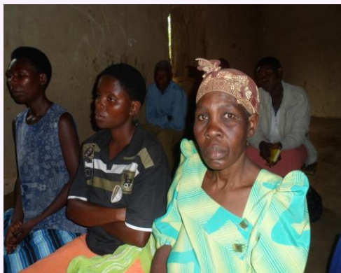
Women were key active participants in the dialogues