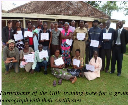
Participants of the GBV training pose for a group photograph with their certificates

Against this background therefore, Better HAG Uganda successfully conducted