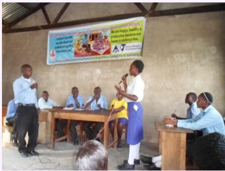
Who Actually Experiences more violence? Student panelists challenge one another during the debate

leading to psychological abuse. Another form of violence against girls is manifest in forced/early marriages which sometimes is promoted by their own parents.