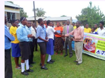
Debate participants are awarded with books