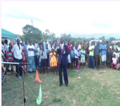
The E.D, Better HAG Uganda delivers his speech during an awareness campaign

During this period, seven (7) anti-VAWG multi-faceted awareness and educational outreaches were conducted at Bumbo Primary School and Maala Primary School, Bubutu, Bwiri-Bumwoni S/C, Buwabwala T/C, Matuwa T/C and finally at Tsekululu Trading center reaching an estimated 5,600 people (over 60% of whom women and girls) through multiple channels. The campaigns were furnished with integrated anti-GBV awareness raising and education activities including health talks, confidential legal assistance and advice, live theatre performances on GBV, anti-VAW/G marathons, HIV Counseling and