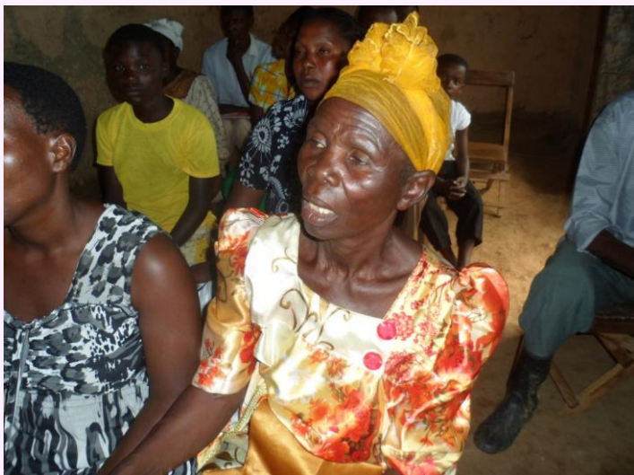
A woman raises issues on violence in one of the community dialogues