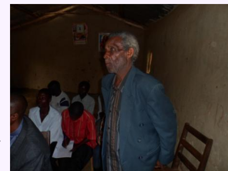
An elderly man talks about the gaps in the Gisu Culture

In all the 13 dialogues conducted, Better HAG Uganda was glad to note positive statements accruing from participants through post-dialogue interviews with different participants. Holders of the customary law i.e. the clan heads and other traditional leaders; expressed positive change in perception towards, among others; women and girls' inheritance and property rights, educational rights of the girl-child as well as wife beating. "....we have grown up seeing all these injustices inflicted on our women,....I have personally been an advocate of our culture without forecasting the negatives about it, but now my eyes have been opened.....some of my daughters and granddaughters have been married off at an early age after prematurely pulling out of school and yet we did not envisage that they would be more productive if they had completed school...we only minded about the little money paid as a fine after holding secret meetings with families of perpetrators....and yet eventually the dowry given has all been consumed up....I have learned a lot and I