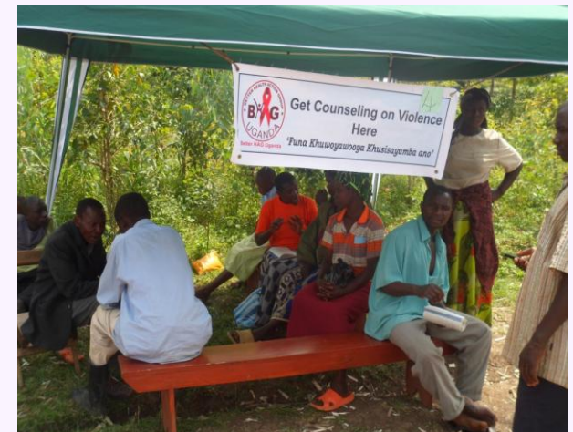
Women get legal assistance and advice on dealing with GBV

177 women and adolescent girls benefited from the free confidential legal assistance and advice services provided during the 7 community awareness campaigns on gender based violence.