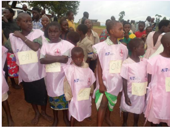
We can defeat Violence: Young girls get ready to participate in the race against VAWG

3 anti-GBV (VAW/G) awareness marathons were conducted at Bumbo Primary School, Bubutu and Bwiri Primary School. Respective area Local Council I Chairpersons did mobilize for marathon participants under the categories/clusters; Young boys (10-14), Young girls (10-15), men and adolescent boys (18-40+) and women and adolescent girls (18-35). Efforts were made to engage the elderly (55+) turned at Bubutu in a short race (100m).