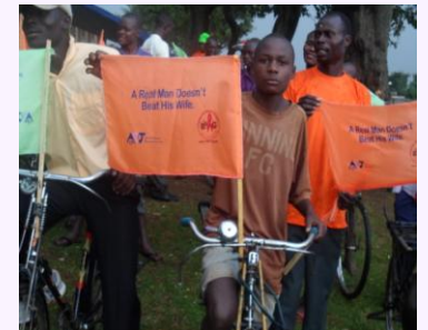
Male Involvement in the GBV Response: Young men display flags with printed anti-VAWG messages

We planned and conducted only 2 bicycle races in respective communities of the GBV awareness campaigns. Bicycles were decorated with flags with printed anti-VAW/G messages such as ' Stop marriages for girls under the age of 18 ', ' Your partner isn't your kick-boxing opponent ' ' A real man doesn't beat his wife ' and their equivalents in Lugisu. These