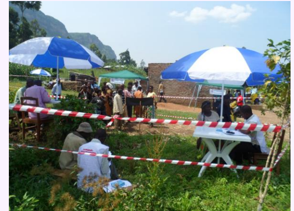
Post-Test Counseling Camp: The ribbons ensure confidentiality

It has always been incumbent upon Better HAG Uganda management to orient the HCT team we work with on the need to integrate issues consistent with the linkage between HIV and GBV during both pre and post-test counseling sessions. Also integrated were messages in line with maternal, neonatal and child health (MNCH)-particularly encouraging both women and men to embrace antenatal care when pregnant or when their wives got pregnant. This would help to curb preventable maternal and neonatal deaths owing to manageable complications when such cases are