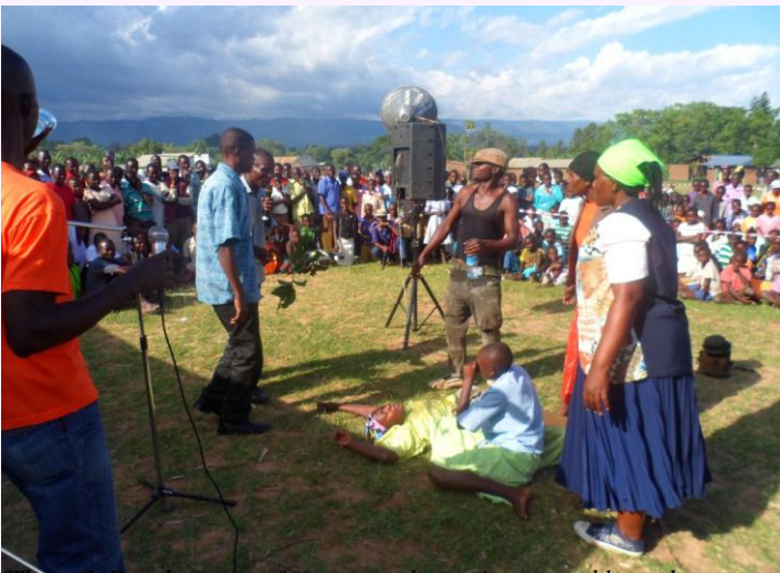
Through live theatre performances, the project was able to demonstrate the magnitude of VAWG during awareness campaigns and school programs

Like in many other countries across the universe, violence against women and girls in Uganda is one of the most widespread violations of human rights. It includes physical, sexual, psychological and economic abuse, and it cuts across boundaries of age, race, culture, wealth and geography. It takes place in the home, on the streets, in schools, the workplace, in farm fields, refugee camps, during conflicts and crises. It has many manifestations — from the most universally prevalent forms of domestic and sexual violence, to harmful practices such as sex-selection or child, widow inheritance, forced and/or early marriages, abuse during pregnancy, dowry related violence; among others. In many