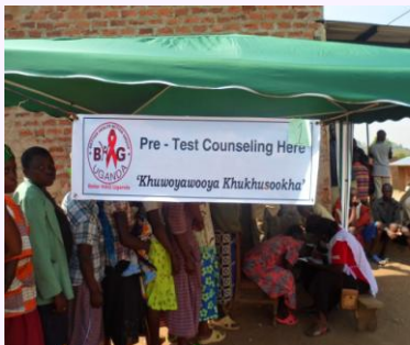
HCT Registration and Pre-Test Counseling: The number was overwhelming in most communities

However, people first need to get used to and appreciate the idea further before they are encouraged to pay a pocket friendly marathon participation fee.