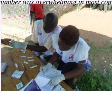
HCT Lab in the community