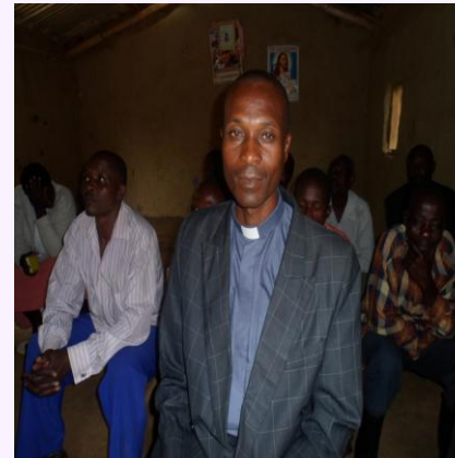
Religious leaders were key participants in the dialogues

We also used community dialogues as a forum for spearheading establishment of Community Referral and Protection (COREP) centers in various communities.