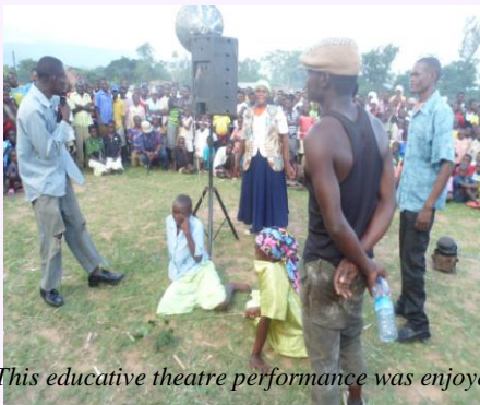
This educative theatre performance was enjoyed by a cross section of people in communities and schools

In recognition of the power and niche in Performing Arts (PA) or music, dance and drama as widely known to many; Better HAG Uganda employed this strategy to disseminate information on GBV (VAW/G) trends, effects and the need for & process in response to the vice at different levels. This approach was employed because it not only has a blend of education and entertainment (edutainment)