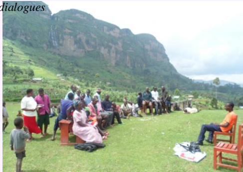
The project even reached the inadequately served populations in the mountains (Elgon ranges)

Namunyiri, Nabitsikhi, Buwabwala, Bumwaali, Buwambwa, Maresi, Post-Office-Magale, Situyi P/School and Butinduyi-Matuwa. Mobilization was done by Better HAG Uganda focal point persons, most of whom had participated in either the orientation meeting or capacity building workshop or both. A total of 398 people were reached through dialogues, majority of whom (50%) being traditional and clan leaders/elders. Other participants included Local Council 1 Chairpersons, religious leaders, school going youth, men, boys and selected beneficiaries (women).