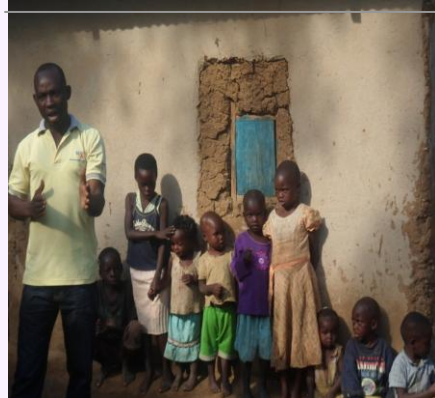
The Executive Director highlights on some of the legislative framework of dealing with such a case.