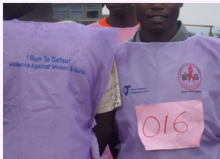
Young men display their marathon aprons with printed anti-GBV message