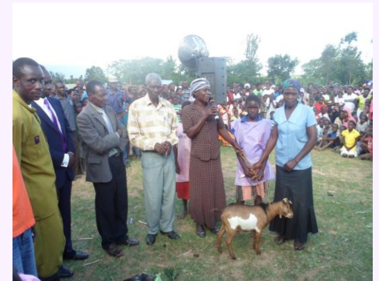
Eradicating Poverty = Eliminating VAWG: A young girl stands besides her mother as the LC III Woman Councilor hands her a goat after emerging winner in the girls' category.

Better HAG Uganda arranged for and gave awards in form of goats, chicken and project t-shirts to the winners, first and second runners-up respectively for