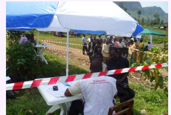
A couple gets post-test counseling